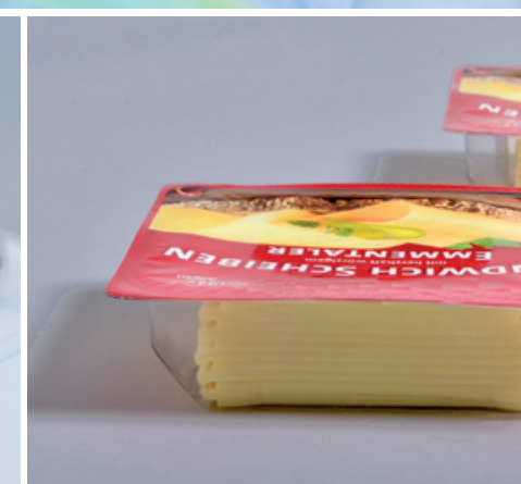
A&D SAMPLE APPLICATIONS.